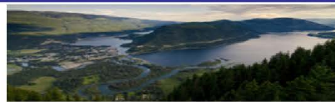
More wineries, orchards, markets and beaches in Thompson-Shuswap