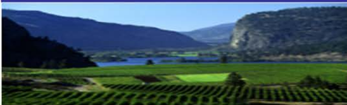
Wineries, orchards, markets and beaches in the Okanagan Valley